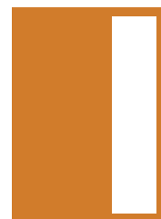
1/3 Page Vertical 1.554" x 6.45"